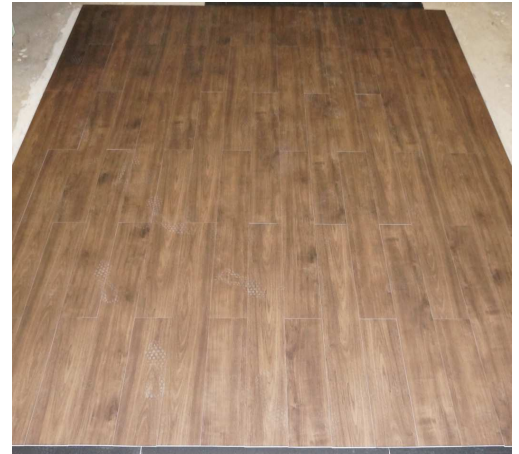
Test specimen laid on concrete test-floor